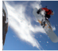
Without frame interpolation