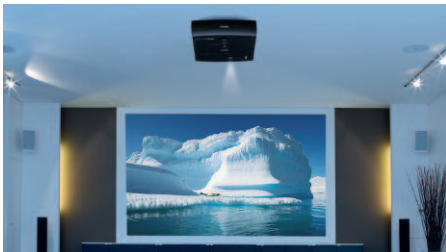
Enjoy the ultimate cinema experience at home